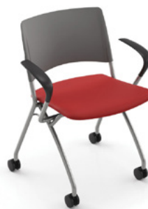
1725-US With arms 19 lbs

Exceeds BIFMA Seating Durability Test to 500 lbs CAL 133, add $106 List 1/2" extra seat foam, specify and add $14 List