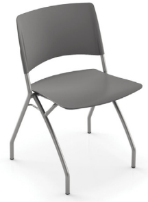
1734 Without arms 16 lbs