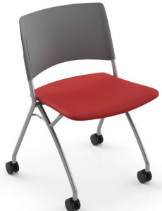
1735-US Without arms 19 lbs