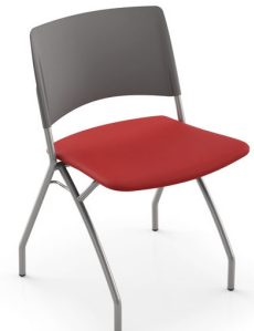
1734-US Without arms 19 lbs