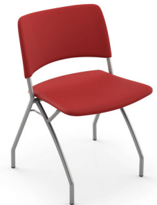
1734-UP Without arms 19 lbs