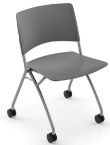
1735 Without arms 16 lbs