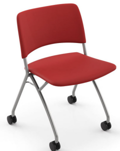
1735-UP Without arms 19 lbs