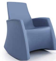
8840 36 lbs

Exceeds BIFMA Seating Durability Test to 500 lbs