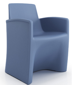
8708 With arms 28 lbs