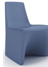
8701 Without arms 23 lbs

Exceeds BIFMA Seating Durability Test to 500 lbs