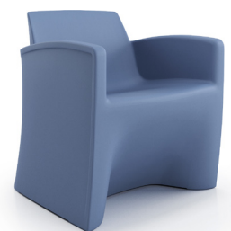
8808 With arms 31 lbs