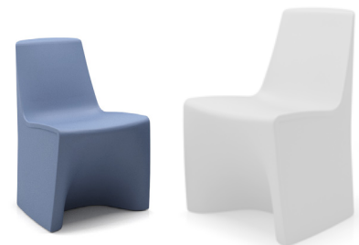
8702 Without arms 19 lbs

Exceeds BIFMA Seating Durability Test to 500 lbs