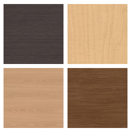
Select clear maple shell finish or one of our 9 standard wood stains at no upcharge.