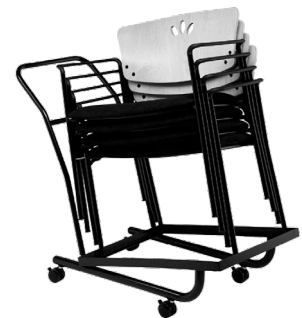
1899G/1899M Midsize/Bariatric 24 lbs