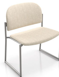
1843 Without arms 27 lbs

Exceeds BIFMA Seating Durability Test to 500 lbs CAL 133, add $87 List 1" extra seat foam, specify and add $32 List