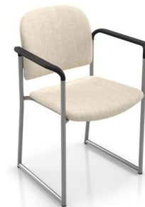
1831 With arms 23 lbs

Exceeds BIFMA Seating Durability Test to 500 lbs CAL 133, add $62 List 1" extra seat foam, specify and add $15 List