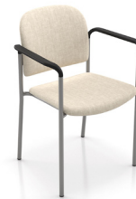
1801 With arms 20 lbs