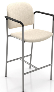
1821 With arms 23 lbs

Exceeds BIFMA Seating Durability Test to 500 lbs CAL 133, add $62 List 1" extra seat foam, specify and add $15 List