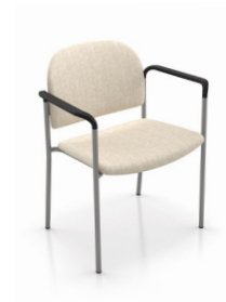
1804 With arms 22 lbs