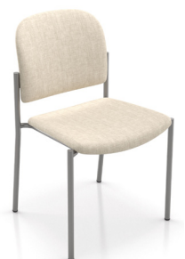
1811 Without arms 19 lbs