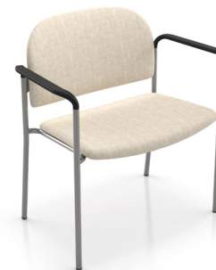
1803 With arms 26 lbs

Exceeds BIFMA Seating Durability Test to 500 lbs CAL 133, add $87 List 1" extra seat foam, specify and add $32 List