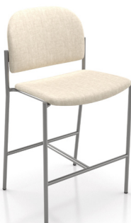
1826 Without arms 24 lbs