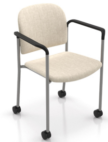
1802 With arms 19 lbs

Exceeds BIFMA Seating Durability Test to 500 lbs CAL 133, add $62 List 1" extra seat foam, specify and add $15 List