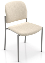
1811 Without arms 19 lbs