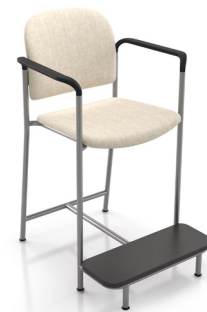
1821E With arms 32 lbs

Exceeds BIFMA Seating Durability Test to 500 lbs CAL 133, add $62 List 1" extra seat foam, specify and add $15 List