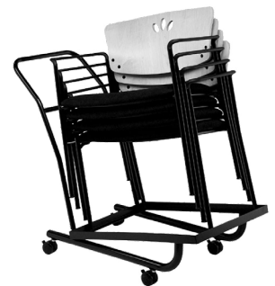
1899G/1899M Midsize/Bariatric 24 lbs