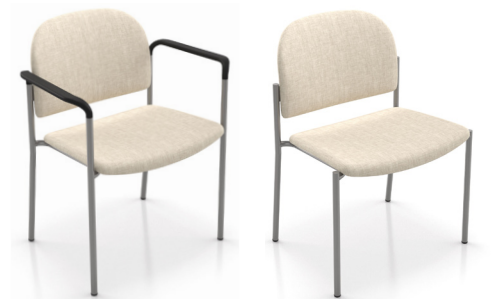
1804 With arms 22 lbs

Exceeds BIFMA Seating Durability Test to 500 lbs CAL 133, add $87 List 1" extra seat foam, specify and add $23 List