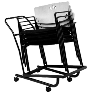
1899G/1899M Midsize/Bariatric 24 lbs