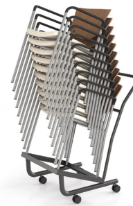
1899 Standard 18 lbs