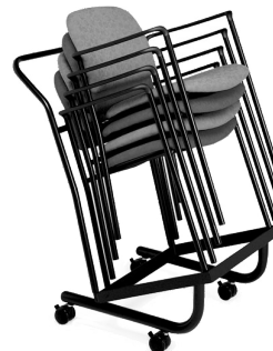
1899 Standard 18 lbs