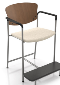
1924E With arms 32 lbs

Exceeds BIFMA Seating Durability Test to 500 lbs CAL 133, add $44 List 1" extra seat foam, specify and add $23 List