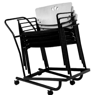
1899M Midsize 24 lbs