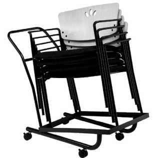
1899G/1899M Midsize/Bariatric 24 lbs