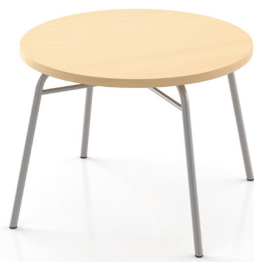
24SFR Not Stackable