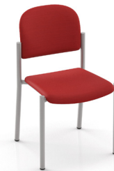
1805 10 lbs