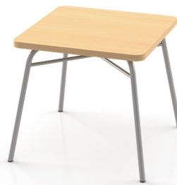
24SFSQ Not Stackable