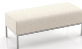
9102B 57 lbs

Exceeds BIFMA Seating Durability Test to 570 lbs CAL 133, add $202 List per unit