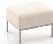
9101B 26 lbs

Exceeds BIFMA Seating Durability Test to 500 lbs CAL 133, add $101 List per unit