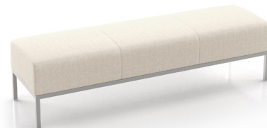
9103B 100 lbs

Exceeds BIFMA Seating Durability Test to 750 lbs CAL 133, add $303 List per unit