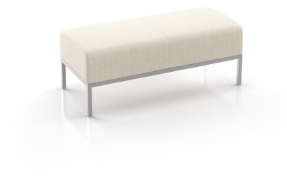
9102B 57 lbs

Exceeds BIFMA Seating Durability Test to 570 lbs CAL 133, add $202 List per unit