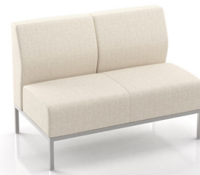
9102MB 92 lbs

Exceeds BIFMA Seating Durability Test to 570 lbs CAL 133, add $418 List per unit