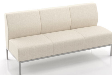
9103MB 137 lbs

Exceeds BIFMA Seating Durability Test to 750 lbs CAL 133, add $627 List per unit