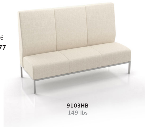
9103HB 149 lbs

Exceeds BIFMA Seating Durability Test to 750 lbs CAL 133, add $829 List per unit