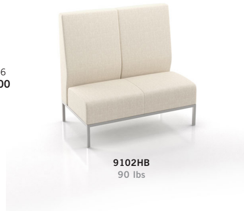
9102HB 90 lbs

Exceeds BIFMA Seating Durability Test to 570 lbs CAL 133, add $543 List per unit