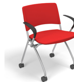
1705-UP With arms 22 lbs

Exceeds BIFMA Seating Durability Test to 500 lbs CAL 133, add $115 List 1/2" extra foam, specify and add $21 List