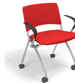
1705-UP With arms 23 lbs

Exceeds BIFMA Seating Durability Test to 500 lbs CAL 133, add $125 List 1/2" extra foam, specify and add $23 List