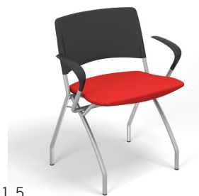
1704-US With arms 23 lbs

Exceeds BIFMA Seating Durability Test to 500 lbs CAL 133, add $114 List 1/2" extra foam, specify and add $23 List