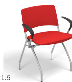
1704-UP With arms 23 lbs

Exceeds BIFMA Seating Durability Test to 500 lbs CAL 133, add $125 List 1/2" extra foam, specify and add $23 List