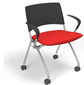
1705-US With arms 23 lbs

Exceeds BIFMA Seating Durability Test to 500 lbs CAL 133, add $114 List 1/2" extra foam, specify and add $23 List