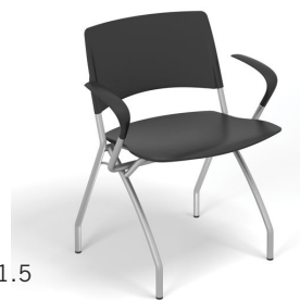
1704 With arms 21 lbs

Exceeds BIFMA Seating Durability Test to 500 lbs CAL 133, add $104 List