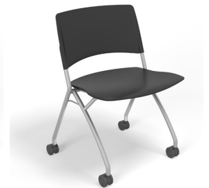
1715 Without arms 19 lbs