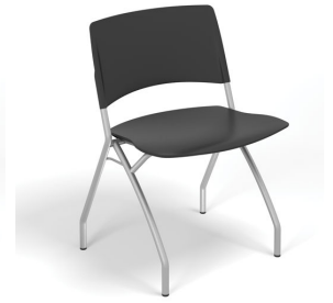
1714 Without arms 19 lbs