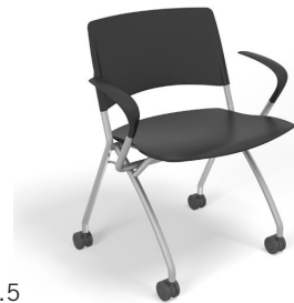
1705 With arms 21 lbs

Exceeds BIFMA Seating Durability Test to 500 lbs CAL 133, add $104 List