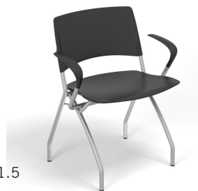
1704 With arms 21 lbs

Exceeds BIFMA Seating Durability Test to 500 lbs CAL 133, add $99 List