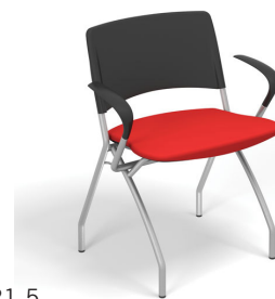
1704-US With arms 23 lbs

Exceeds BIFMA Seating Durability Test to 500 lbs CAL 133, add $109 List 1/2" extra foam, specify and add $21 List