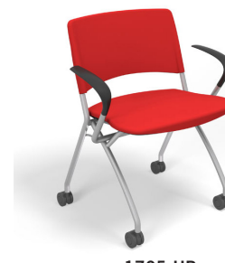
1705-UP With arms 23 lbs

Exceeds BIFMA Seating Durability Test to 500 lbs CAL 133, add $124 List 1/2" extra foam, specify and add $22 List