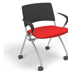
1705-US With arms 23 lbs

Exceeds BIFMA Seating Durability Test to 500 lbs CAL 133, add $113 List 1/2" extra foam, specify and add $22 List