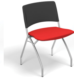
1714-US Without arms 21 lbs