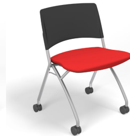
1715-US Without arms 21 lbs