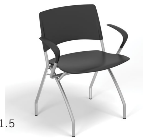
1704 With arms 21 lbs

Exceeds BIFMA Seating Durability Test to 500 lbs CAL 133, add $103 List